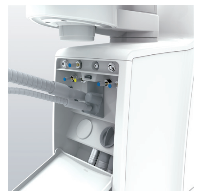
Vacuum Line Clean System Option Daily use of the integrated suction cleaning system prevents build-up of debris in the vacuum line and helps to maintain constant suction.