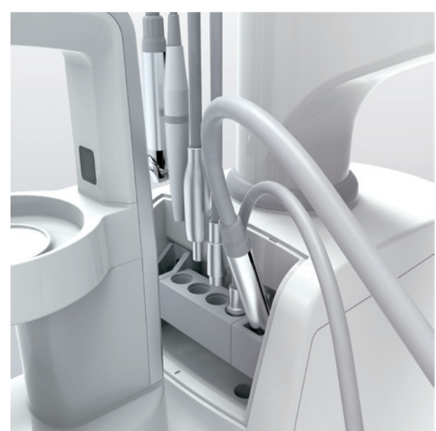
Flushing system Option The integrated handpiece flushing system inhibits biofilm build up and bacterial growth in the handpieces hoses.