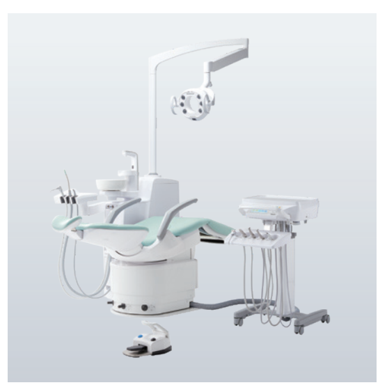
\ensuremath{^\star}\mbox{Please} acknowledge that this catalog image may differ from the actual product.