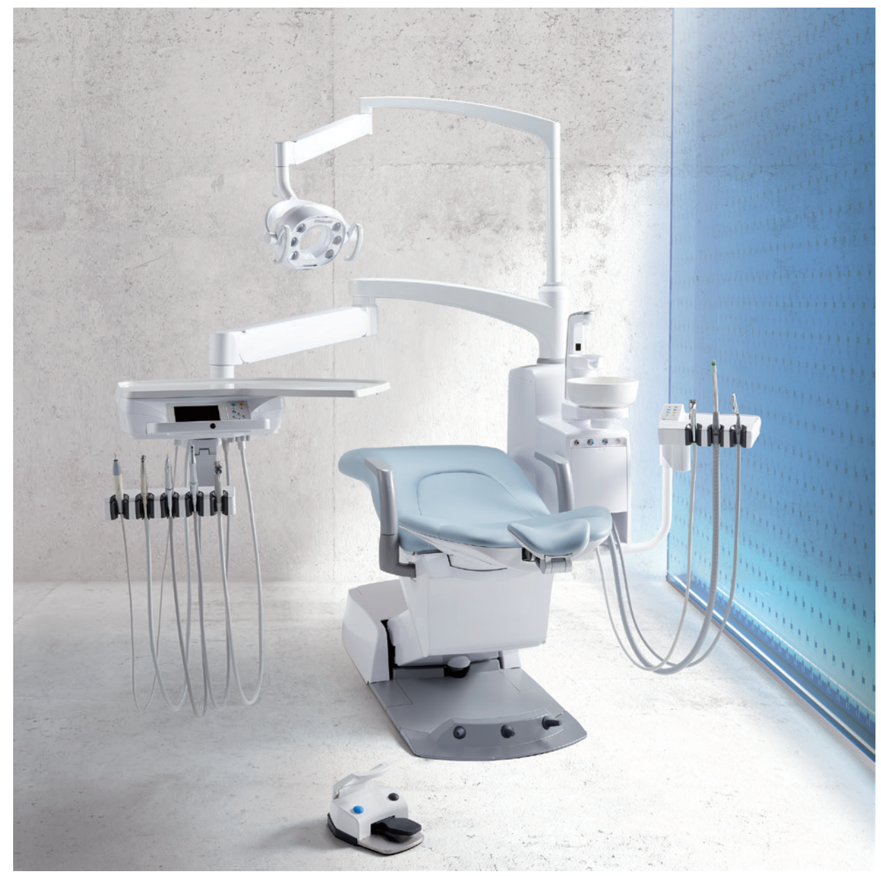
*The installation image for left-handed specification.

The holder, designed to be independent from the table, can be freely adjusted with a three-axis adjustment mechanism for the position best suited for each dentist.