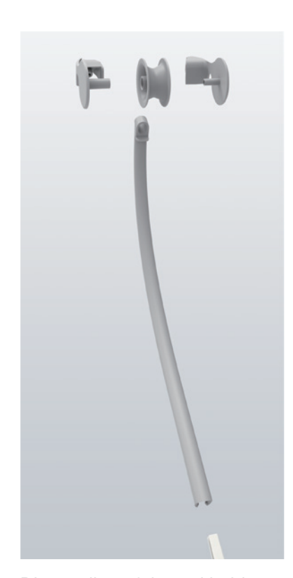
Dismantling of the rod holder The end parts of the rod can easily be dismantled for cleaning.

The hygienic condition inside the chair unit is maintained by water line flushing, so that patient-friendly treatment can be administered. As an environmentally friendly option, the unit comes with a separator or a separator with an amalgam collector, which helps reduce facilitating everyday maintenance.