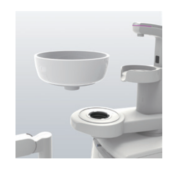
Detachable bowl The ceramic bowl can easily be detached for cleaning and can therefore always be in a clean condition.