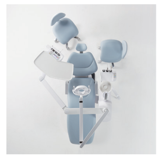
Four-hand In four-hand position, the large tabletop provides a common space for the dentist and the assistant, facilitating smooth treatment.