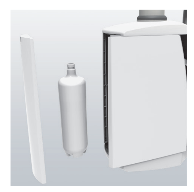
Water bottle Option