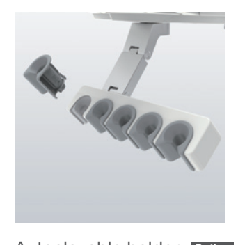
Autoclavable holder Option The dentist outlets and the assistant outlets can both be autoclaved and detached for cleaning.