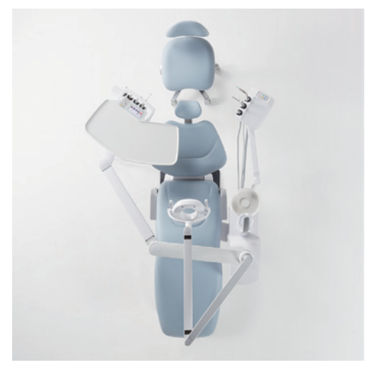
Two-hand The long reach and light movement of the arm facilitate two-hand treatment to be administered without stress.

The compactly designed chair unit can be installed in a space as narrow as 1,8m across for full use of its capabilities, allowing enough workspace for both two-hand and four-hand treatment. The over-arm is fitted for treatment in both standing and sitting positions. The dentist/dental assistant can efficiently administer treatment from various orientations from the 8 o'clock to 2 o'clock directions.