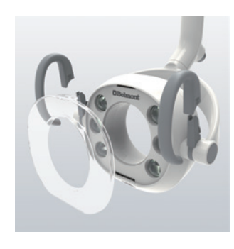
Detachable light components Option Lens cover and autoclavable light handle can be removed with a single lever action for easy cleaning.