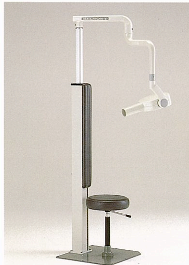
DX-073 RK II Room Type

Searcher 70 control panel is designed for operating ease and cleaning ease with smooth pictographic selection switch panel. The hand exposure switch incorporates a safety feature.